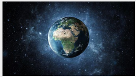
Earth and Space