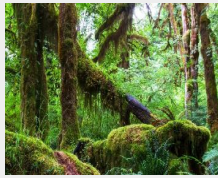
Why rainforests are important to us