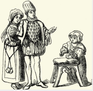
How children's lives have changed